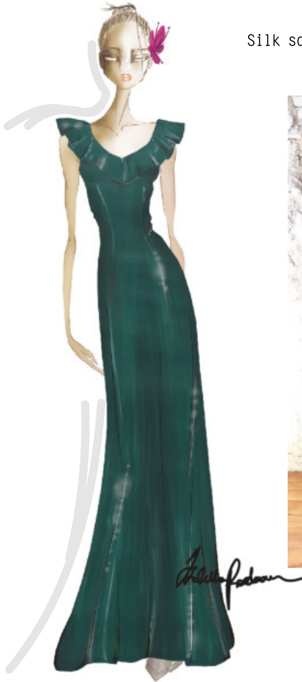
Silk satin dress.