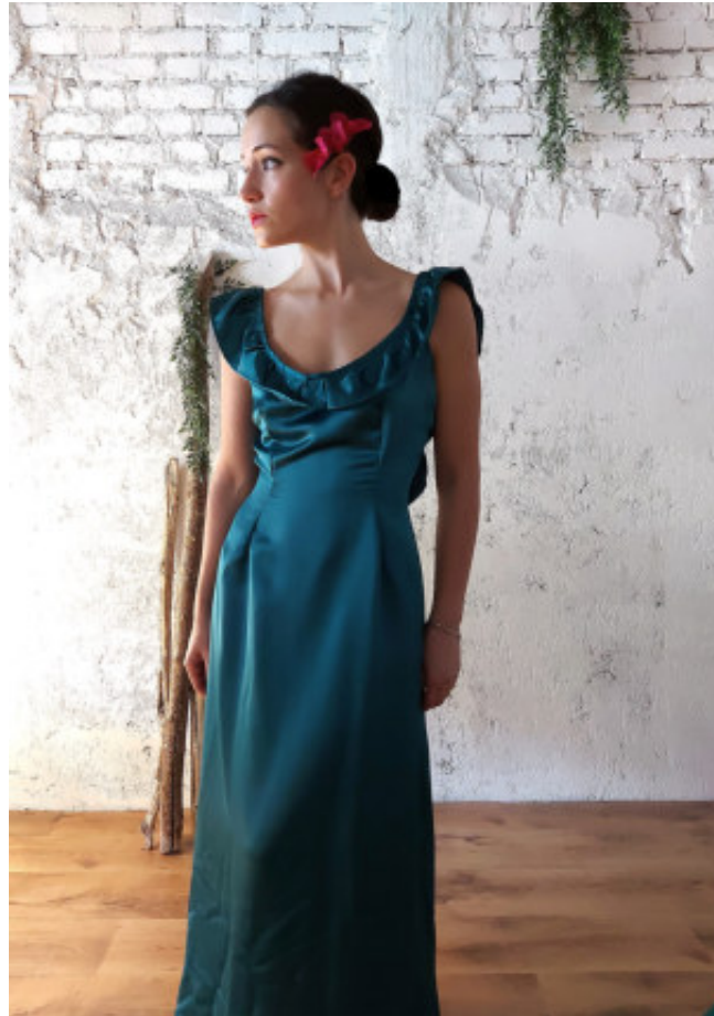
A line dress.